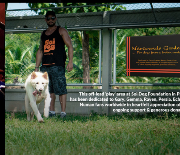
An off-lead area sign, dedicated to Gary Numan and his family and the generous Numanoids who've donated so much over the past 2 years.