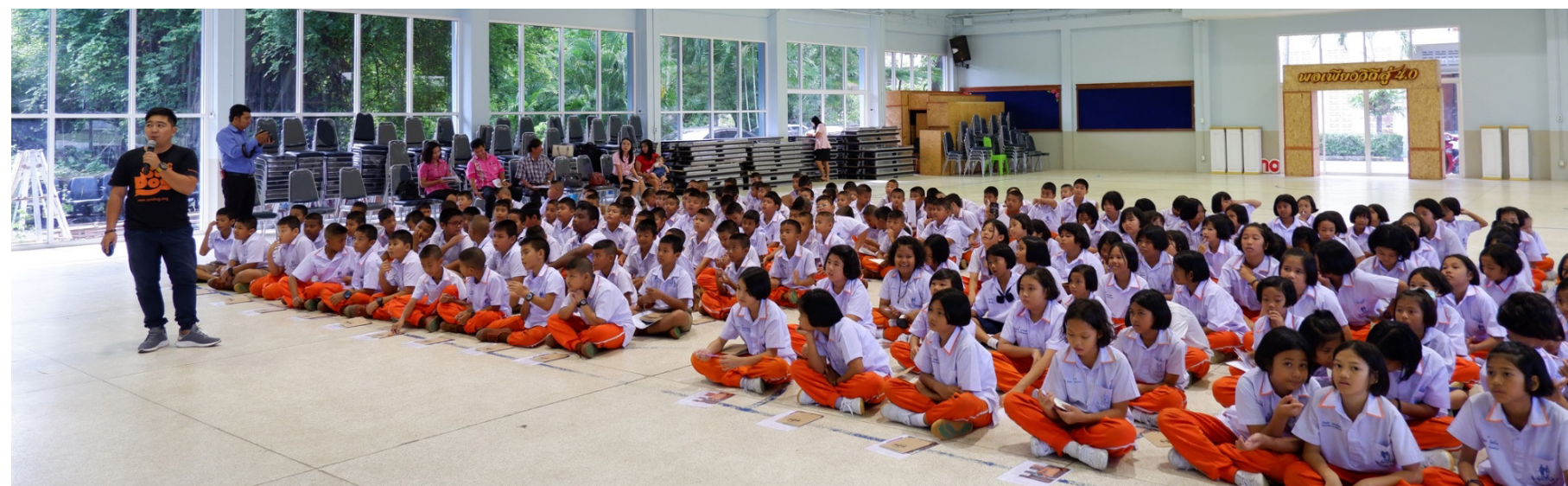
K'Film hosts education sessions at Baan Talat Nuea school and Ban Nabon school and K'Mabel pictured at Karon Kindergarten.

The programme is growing all the time and the new education centre being constructed at Soi Dog will take it to the next level.