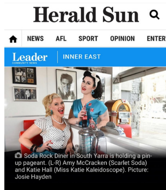
@misskatiekaleidoscope and with @scarletsoda, teaming up for the Miss Soda Rock Pageant held in South Yarra, Sep 7 th .

For hotel reservation: contact directly on +44 (0)1604 739988, ask for Ruth or The Events Team and quote the code SOID 250720.