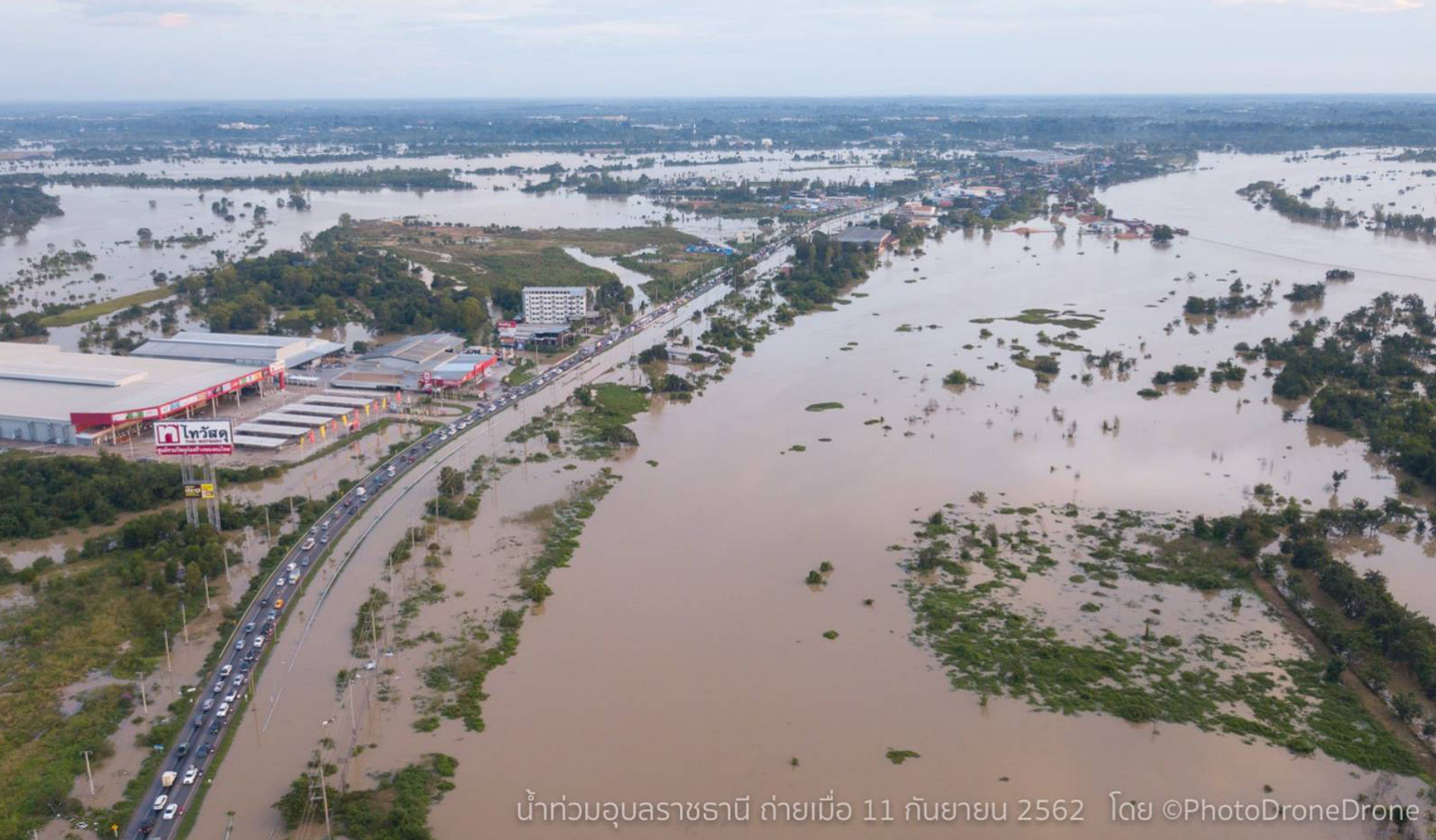
Catastrophic flooding on an unprecedented level in Ubon, following the overflowing of the river Mun.

And for the strays who live around Ubon, their usual areas of habitation were made inaccessible by the floodwater and many of them found themselves isolated, with no access to food. We launched an appeal on September 19 th and have since sent a team there to assess the situation on the ground.