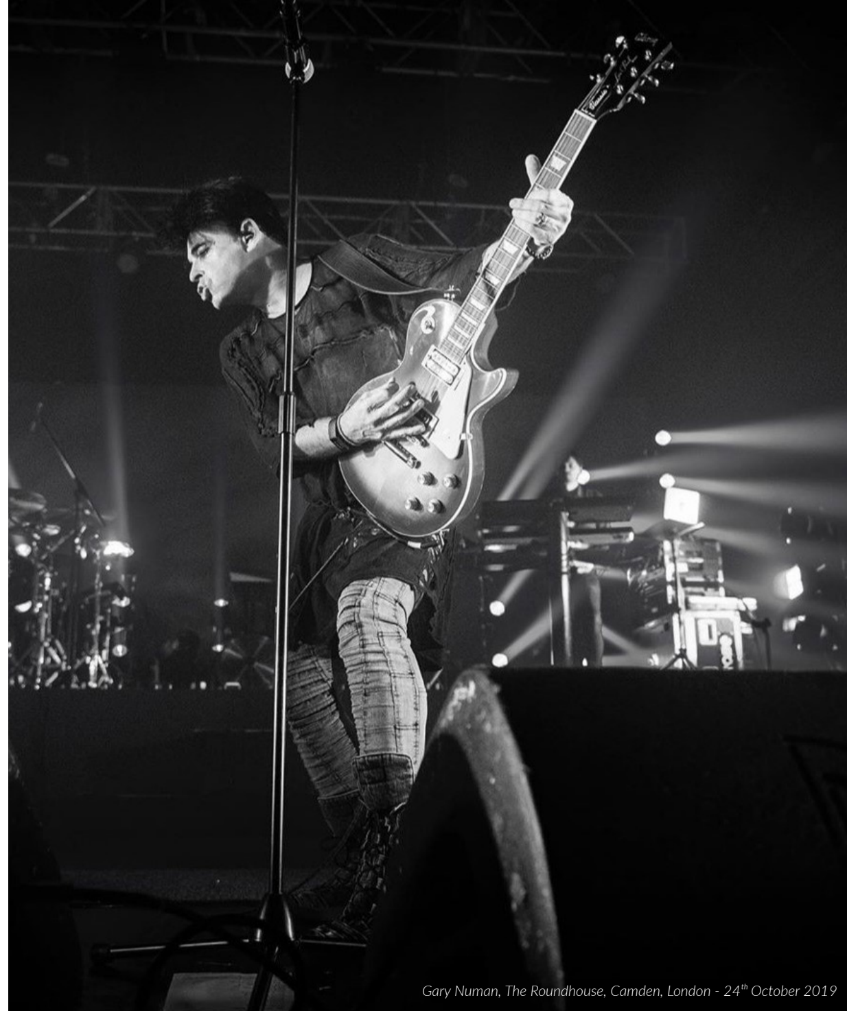
Gary Numan, The Roundhouse, Camden, London - 24 th October 2019